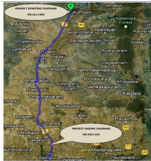
Figure 1: Location of project road

As described earlier the project road lies on NH xx (previously NH yy) and connects <origin> with <destination>, passing through the states of <state 1, state 2>. The proposed project alignment passes through <towns/junctions a, b, c, d> for a total length of <xx km>.